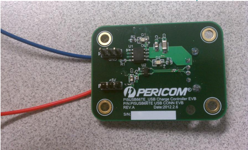
Figure 1: PI5USB66EVB

Figure 1 above illustrates the PI5USB66EVB (evaluation board).